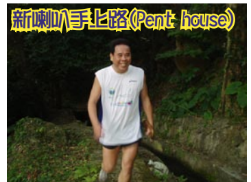
新喇叭手北路 (Pent house) 'Monkey Dick' not so